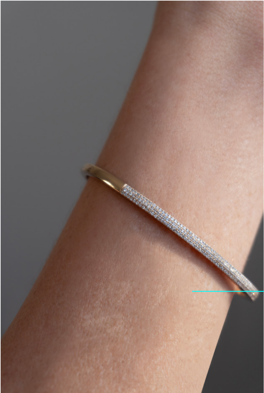
Skin looks patchy, blend better